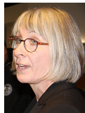
CANADIAN MINISTER OF LABOUR, PATTY HAJDU